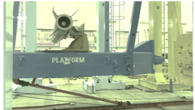
Shock Test (R&DE(E), Pune)