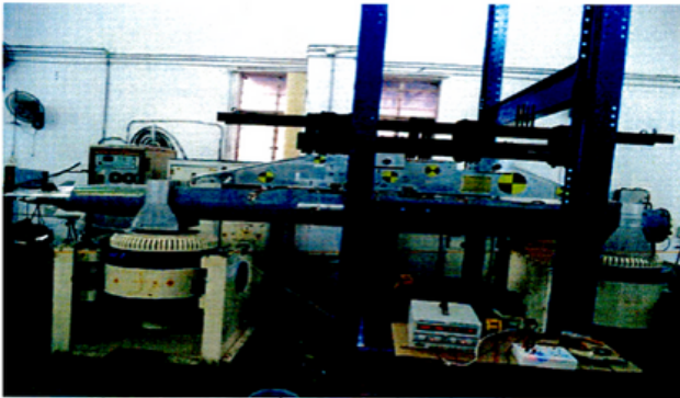
Vibration Test (RCI, Hyderabad)