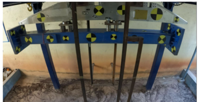
Ejection Test (BHSPL facility, Bangalore)