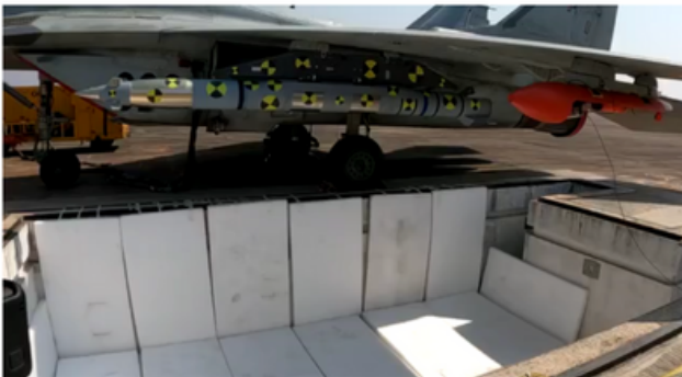
Pit Drop Test